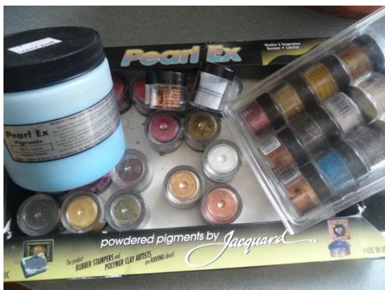
Pearl Ex Pigments, glitter and eye shadow

We will be doing at least two different methods: one loose and one tight with layers. Two images will be needed for this- if you are a non-objective painter, this will also work for you, as well. Get those thinking caps on!